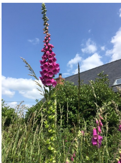
Above, Foxgloves at St John's

I recently went on a nature recording workshop run by Cheshire Wildlife Trust and learnt how to use the iNaturalist app. If you are interested in identifying and recording plants or insects or animals you see this is a great and simple way to do it. You can upload your observations and if they are verified they can be used to help conservation scientists. So armed with my app, I walked round St John's churchyard and observed. It was a good time to do it as a lot of wildflowers are out at the moment. I uploaded all my observations to iNaturalist, and also 'Beautiful Burial Grounds', a project run by Loving God's Acre, who help to organise this weeklong event. So these will be added to those of other churches around the country. This is what I found: