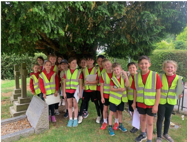
Pupils from Eaton Primary helping to count nature at St Thomas'