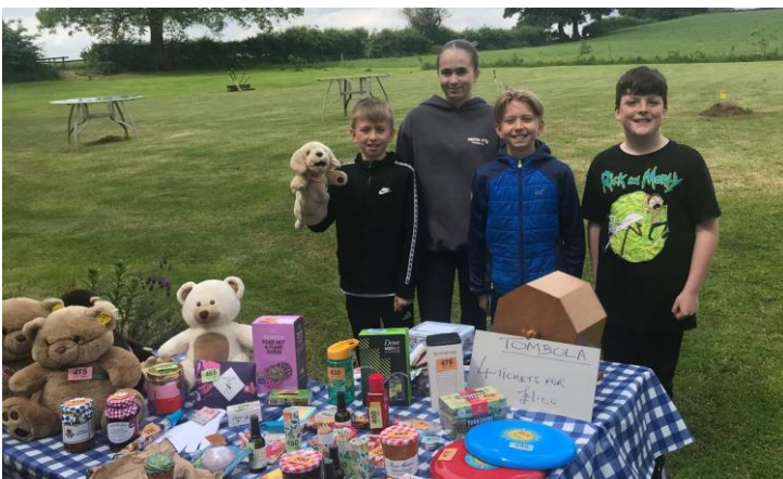
Teddy bear's at the Lunch