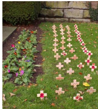
Crosses by our War Memorial

Finally. We did not gather in St Helen's Church or in the streets or by the War Memorial but, thanks to the good work of Tarporley Royal British Legion and many others, we were able to observe Remembrance Sunday "Together whilst Apart" at 11 o'clock on the 8 th November. Before the two minute's silence we heard young people living in Tarporley today read out, in reverence, the names of those who lost their lives in conflict so many years ago.