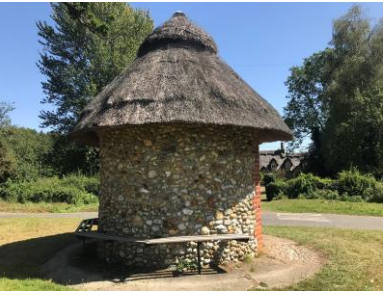
A welcome resting place.

exclusively kept for worship by Lord Walsingham's family). Walking past the round tower to the rear of the Chapel I was surprised to have a panoramic view showing the expanse of the estate. The village of Merton had thatched cottages and even a circular shaped thatched shelter (shown right). A super spot for a rest on the village green for a breathless cyclist!!