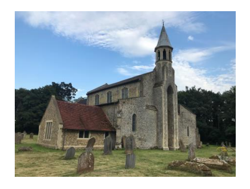
Great Hockham Church showing the modern extension

holiday covered two Sundays, I was able to worship at both. I was impressed with Holy Trinity Church, Great Hockham, at the edge of the Brecks. Even though it dated from the 14<sup>th</sup> Century from the photo I have taken, of note, is the extension housing toilets, kitchen and meeting room. I felt it was quite an achievement to be able to resource the funds for this modernisation. Having been a member of our PCC for many years I understand the faculty process and the